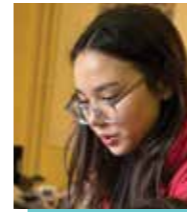
GRACE ROBOTICS ACADEMY LEADER

Available: Weeks 1 & 3, bookable for one week