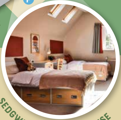
SEDGWICK BOARDING HOUSE