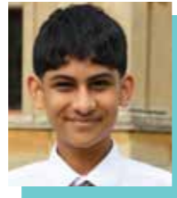
TAKSAL YEAR 8 WESTONBIRT STUDENT

In this challenge, inspired by the ever-popular Dragons' Den series, students research, develop and market a brand-new idea, finally pitching their business to potential investors. They explore budgets, market research and profit margins.